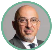
Nadhim Zahawi MP Minister for COVID-19 Vaccine Deployment